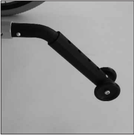
MA 55 Plug-on anti-tipper