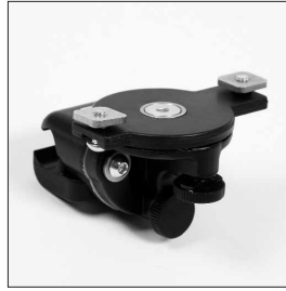
ME 61 Swivel unit