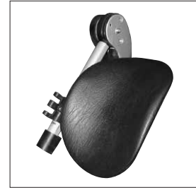
MB 21 Amputation legrest