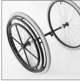
MG 83 One-arm drive