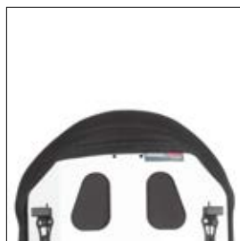
Back profile: active