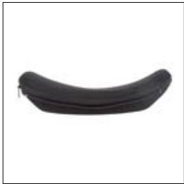
Back support contour: active (64 mm)