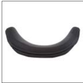
Back support contour: deep (100 mm)