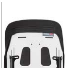
Back profile: semi active