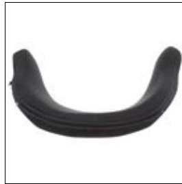
Back support contour: extra deep (150 mm)