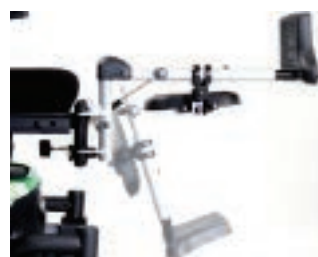
Manual Elevating Legrest