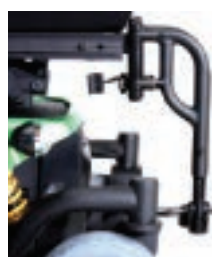
90° Straight Legrest