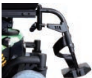
75° Swing-away Legrest