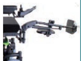
Power Elevating Legrest